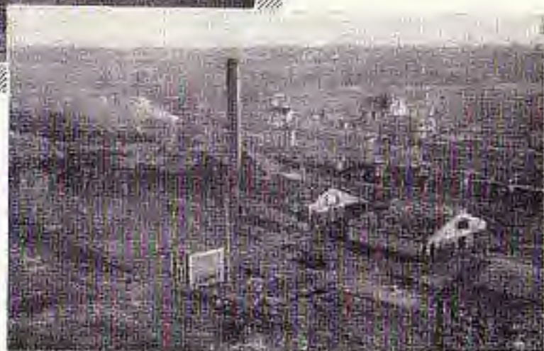
JURDON — FRANCE